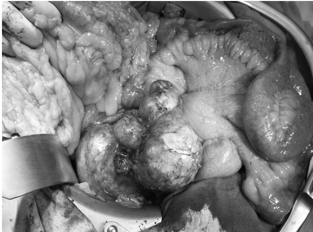
Fig. 2. The transverse colon (left), the jejunum (right), and the multivesicular cystic lesion originated from the uncinate process of pancreas (middle). Note that the photo has been taken intraoperatively

During the exploration, a cystic mass with different sizes of daughter cysts was found in the uncinate process of pancreas infiltrating the retroperitoneum ( Fig. 2 ). The cystic lesion was enucleated and the uncinate process of pancreas was resected ( Fig. 3 ). After an eventless