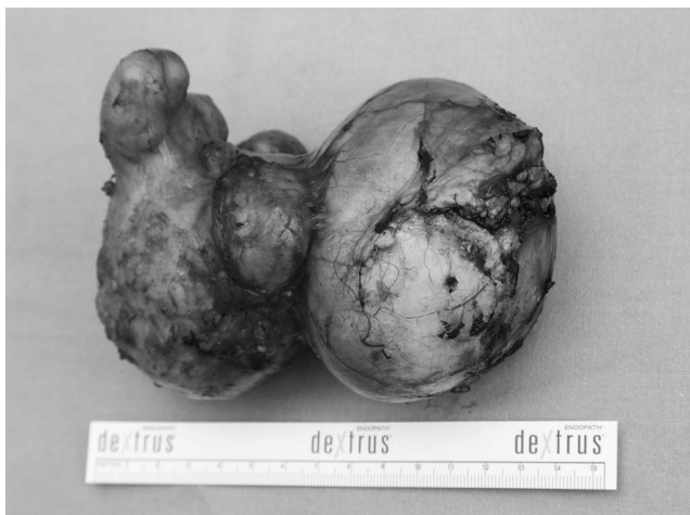
Fig. 3. Image of the removed specimen

postoperative period, patient was discharged from hospital on the 7 th day after the surgical procedure.