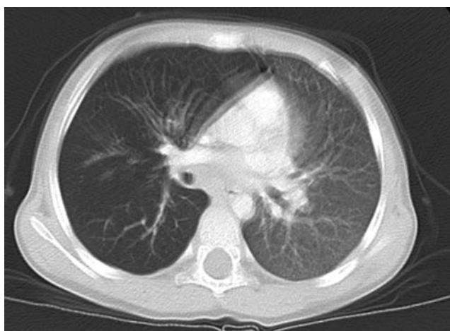
Fig. 3. Axial CT shows the hyperaeration of the right lung