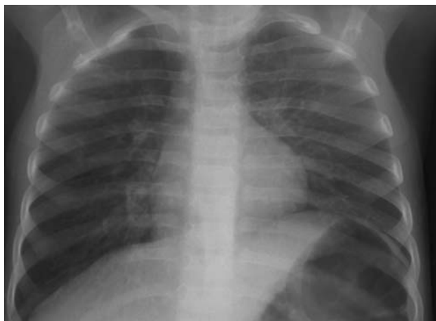
Fig. 1. Posteroanterior chest radiography shows the hyperlucency and hyperexpansion of the right hemithorax

Laboratory examination revealed a white blood cell (WBC) of 11,100/mm 3 , hemoglobin of 14.2 g/dL, and lactate dehydrogenase (LDH) of 271 U/L. Clinical and radiological findings were compatible with foreign body aspiration, the patient underwent bronchoscopy. Bronchoscopy revealed a mass lesion in the right main bronchus but no foreign body. Biopsy of the lesion was performed which revealed diffuse large B-cell lymphoma. After pathologic diagnosis, positron emission tomography-computed tomography (PET-CT) was performed which revealed increased F-18 fluorodeoxyglucose (FDG) uptake in the region of right main bronchus ( Fig. 4 ). We diagnosed the patient as endobronchial recurrence of NHL. The patient received 30 Gy radiotherapy and chemotherapy including ICE regimen (ifosfamid, carboplatin, etoposide) and rituximab. The patient underwent bone marrow transplantation after chemotherapy and radiotherapy and died after transplantation due to cytomegalovirus (CMV) pneumonia.