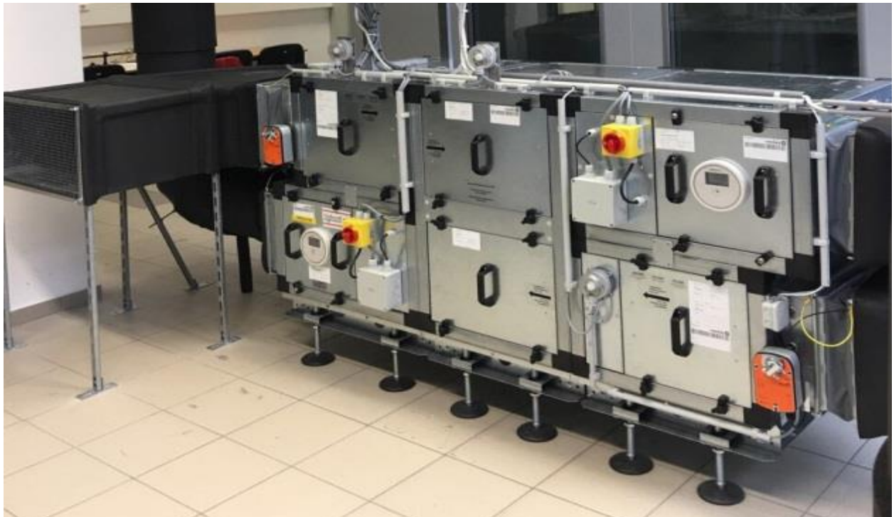
Fig. 1. The experimental test facility

The investigated energy wheel that will be used in this research is a high performance desiccant coatings of the sorption rotor (Molecular Sieve 3 Å) provide a maximum humidity transfer capacity that substantially reduces the energy demand of the HVAC system based on the product catalogue by a high quality producer (ENVENTUS).