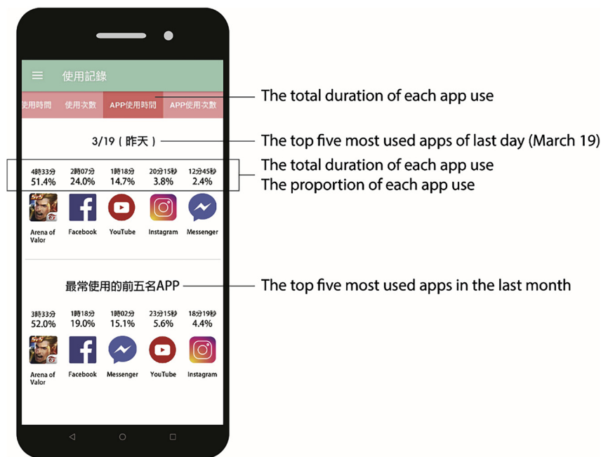
Fig. 2. Screenshot of the “Know Addiction” app user interface, which displays the time spent on each app. This is a screenshot of the “Know Addiction” app user interface from a problematic smartphone user. This app operates in the background and records the screen-on and screen-off timestamps of each app, thus measuring usage. The upper part of the screenshot shows the five most-used apps of the previous day (March 19), including the total duration and proportion of each app use. The lower part of the screenshot shows the five most-used apps of the past four weeks-long period (February 21 to March 19), including the total duration and proportion of each app use. The most-used apps on March 19 were somewhat different from the ranking of the past four months-long period (February 21 to March 19). The third to fifth most-used apps on March 19 were Youtube, Instagram, and Messenger, respectively, while the third to fifth most-used apps over the previous month were Messenger, Youtube, and Instagram, respectively, which reveals fluctuations in mobile apps’ usage

Nevertheless, it is conceivable that smartphone users are unable to recall their counts of smartphone-use episodes within a day. A previous study showed that 16.5% of college students’ smartphone use was too frequent to estimate its total duration; and the other 83.5% of smartphone users inaccurately estimated time spent on smartphones per week, even with the assistance of psychiatrists’ structural interviews (Lin et al., 2015). Two studies have shown significant differences between self-reports and app-recorded time spent on smartphone use (Lin et al., 2015; Montag et al., 2015). In addition, smartphone users with more actual smartphone use would underestimate their use to a greater extent due to “time distortion” effects; the extent of such underestimations has been found to be associated with smartphone addiction (Lin et al., 2015).