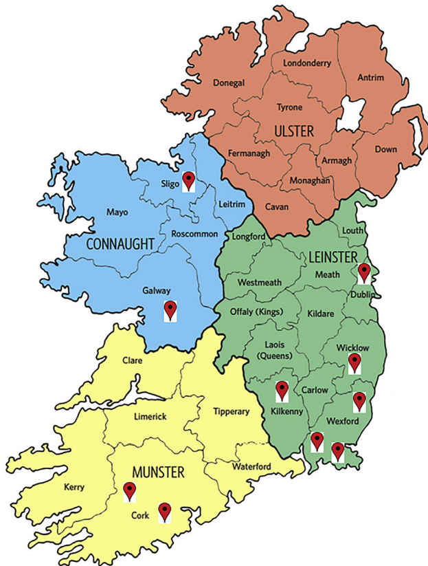
Fig. 2. A representation of the areas of Ireland covered in this research, marked with red pinpoints [map scheme: https://www.familytreemagazine.com/premium/irish-counties-map/# ]

the sake of the study.) Immediately after the blood was drawn, Witness FeLV-FIV ELISA test (Zoetis) was performed according to the manufacturer's instructions. The rest of the samples were frozen and sent to the Department of Pathology, University of Veterinary Medicine Budapest, and were stored at -80^{\circ}\text{C} until further examination.